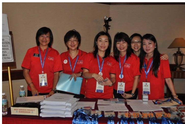
The KC Bukit Bandaraya Team