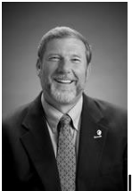
International President-elect Alan Penn

The following District Governors were recognized.