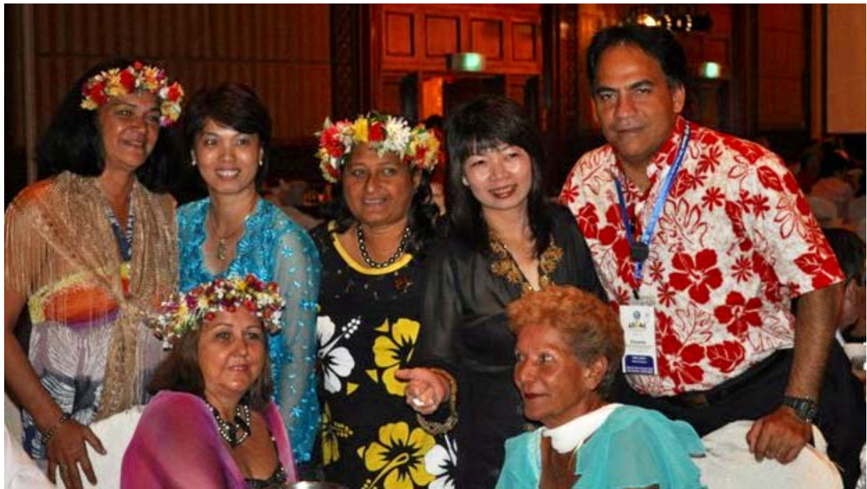
The South Pacific Islanders all had a great time in Melaka