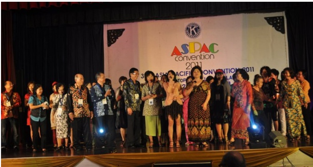
The Malaysian District sings for the best performance competition