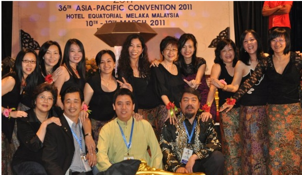
Members of the organizing committee relax at last!